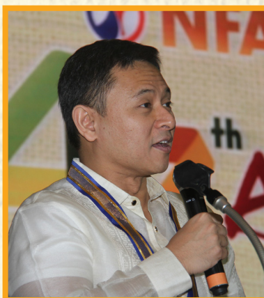
Special guest Senator Sonny Angara