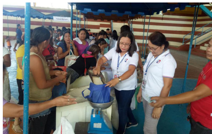
NFA Mamburao participates in Diskwento Caravan