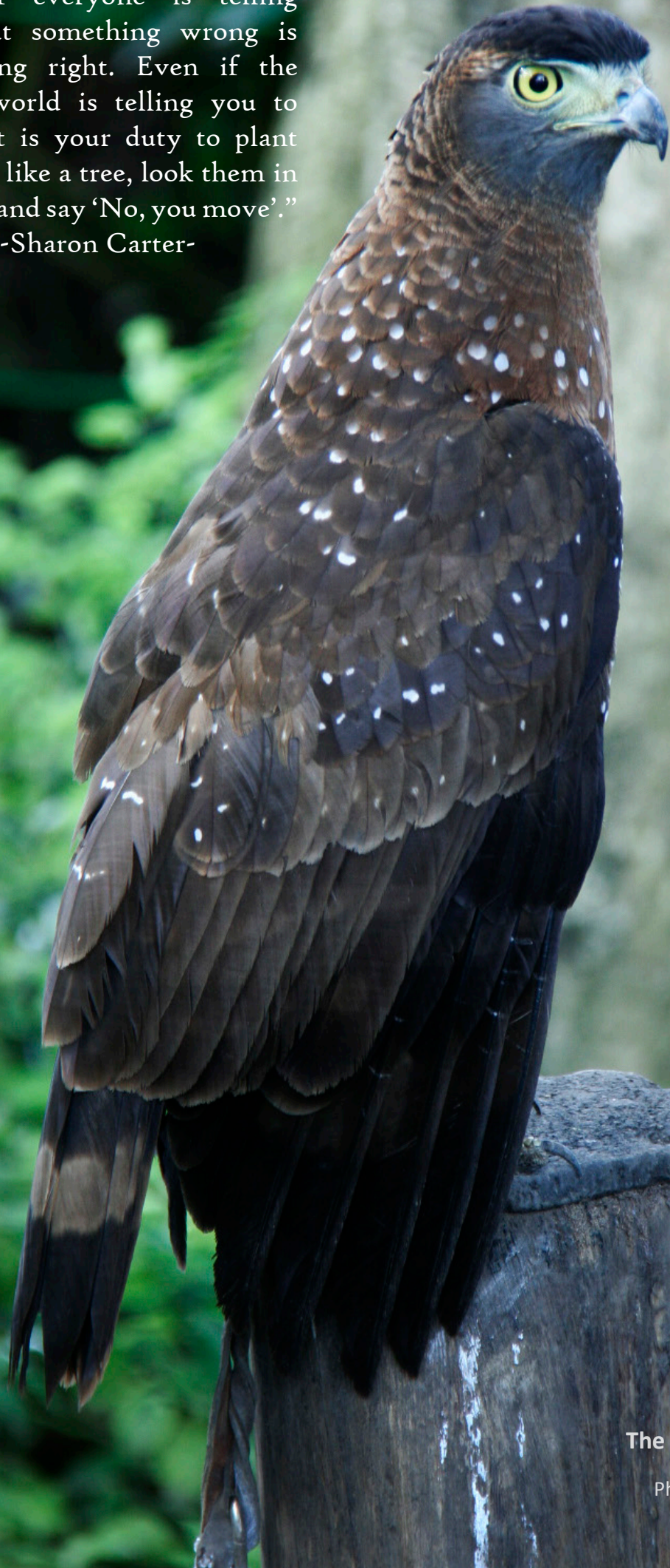
The Philippine Serpent Eagle