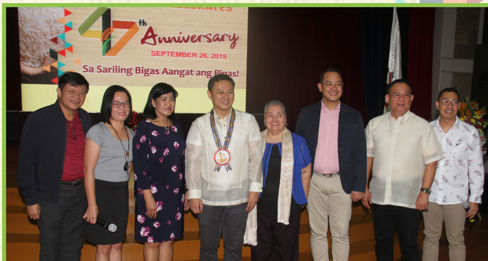
Senator Angara poses with NFA executives and the event's hosts