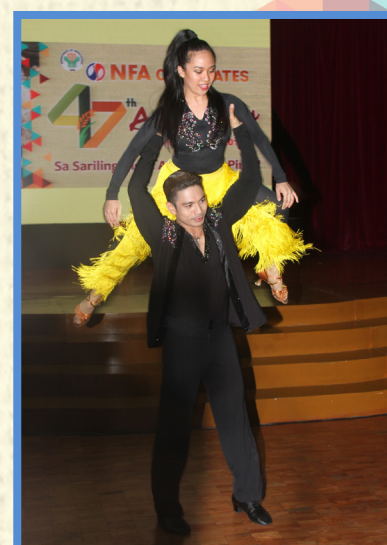
Award-winning performers from PAGCOR left the audience in awe