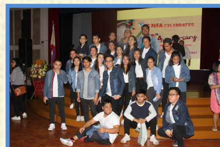
Selected NFA employees performed to a mix of dance medleys