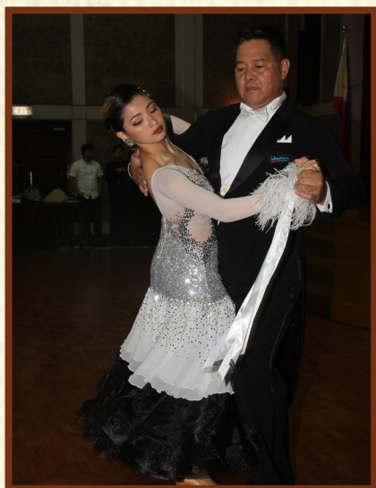
Performers from PAGCOR entertaining the delighted NFA crowd