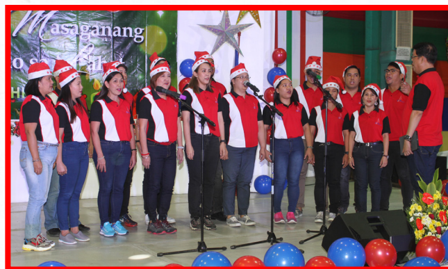
The NFA Chorale singing cheerful Christmas songs

Here's a glimpse of the various Christmas celebrations from the Central Office to the field offices. Happy holidays!