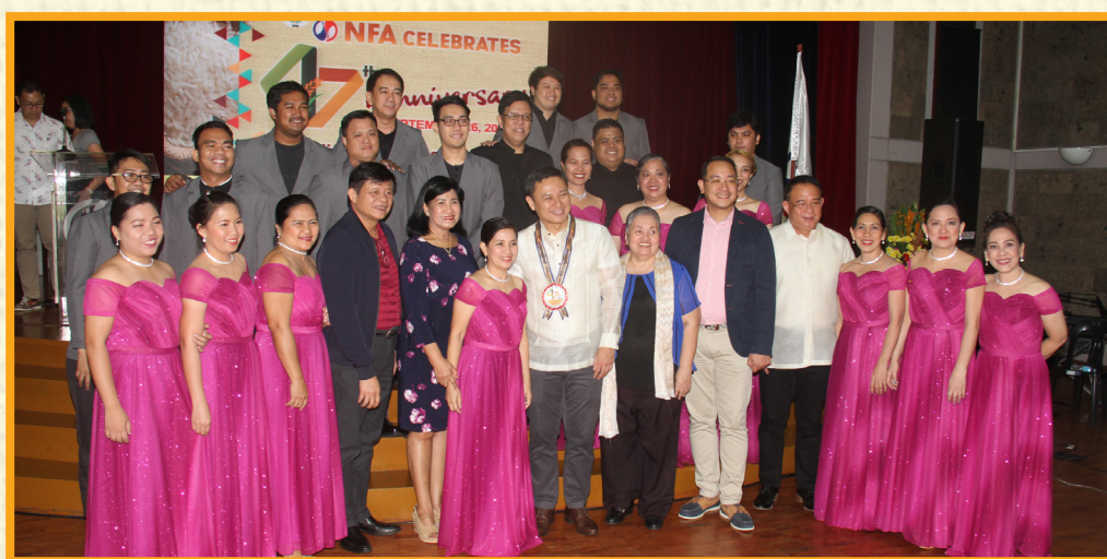
The NFA Chorale gets a chance to a photo opportunity with Senator Angara and NFA executives