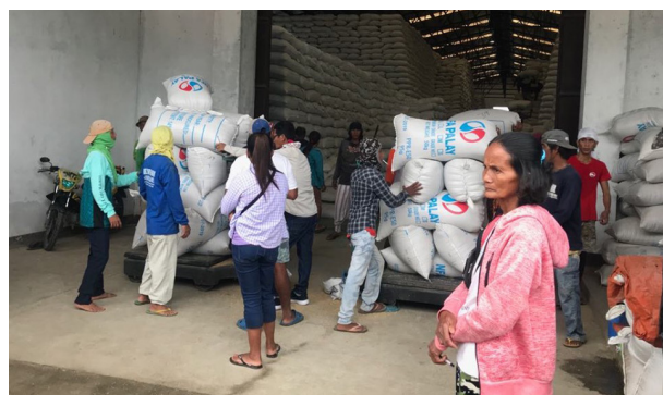
PROCUREMENT. This lady farmer patiently waits for her palay to be weighed. The warehouse is following the policy on the schedule of delivery of palay.