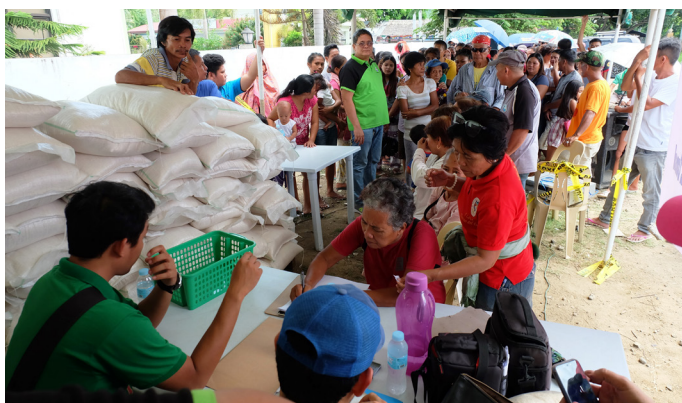
Earthquake victims queue for NFA rice assistance

Rice donation from Korea with a volume of 600 MT or 24,000 bags of 25kg through the ASEAN Plus Three Emergency Rice Reserve (APTERR) is expected to arrive in General Santos City port for distribution to earthquake victims in Davao del Sur and North Cotabato. (CHERYL ANYA C. BUGHAO, correspondent)