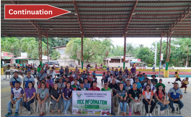
May 27, 2023 - Barangay Ayala, Zamboanga City