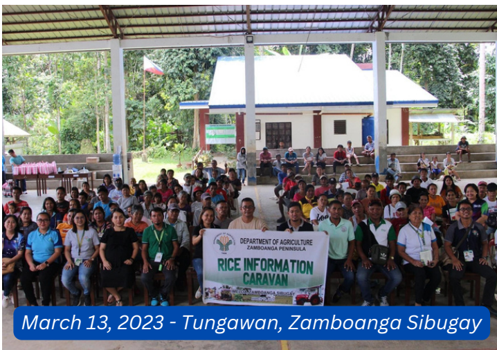
March 13, 2023 - Tungawan, Zamboanga Sibugay