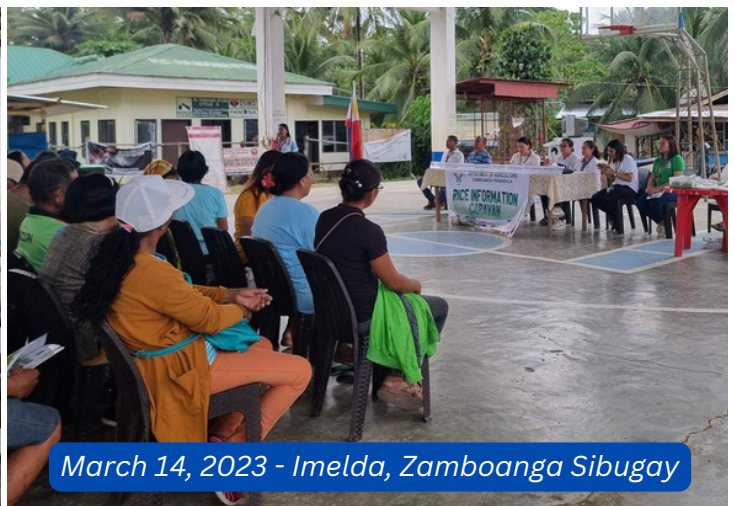
March 14, 2023 - Imelda, Zamboanga Sibugay