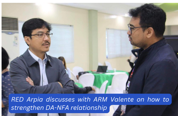
RED Arpia discusses with ARM Valente on how to strengthen DA-NFA relationship