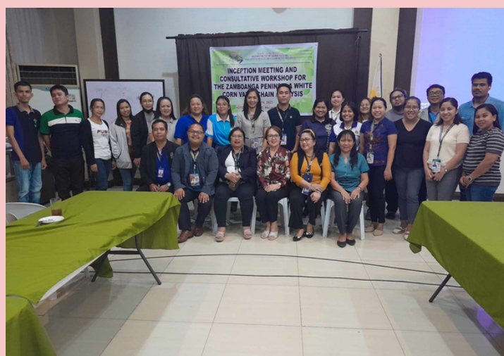
ABM Lumo and BSQAO Araojo with other participants of the Zamboanga Peninsula White Corn Value Chain Analysis

The activity was spearheaded by the Philippine Rural Development Project (PRDP) Regional Project Coordination Office 9 IPLAN Component which aims to create synergy and engage the national government agencies and private stakeholders in the formation of the Zamboanga Peninsula White Corn Value Chain Analysis (VCA) and Competitiveness Strategy. (MPO Aissa Abegail A. Dael)