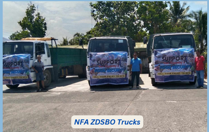
NFA ZDSBO Trucks