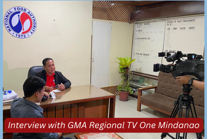
Interview with GMA Regional TV One Mindanao