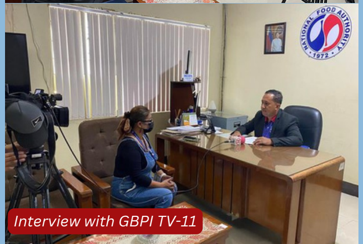
Interview with GBPI TV-11