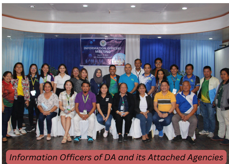
Information Officers of DA and its Attached Agencies