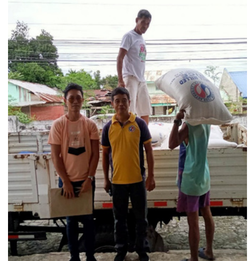
The Municipal Government of Kumalarang purchased a total of 200 bags of NFA Rice on January 11 to 12, 2023 for their relief assistance for the victims of flooding of neighboring province, Misamis Occidental. The Rice were withdrawn from Tiguma A Warehouse, Pagadian City.

NFA Region IX together with the Committee on Disaster Response of RDRRMC-IX and other partnered offices ensure to continuously provide the people sufficient rice buffer stocks and quality services in times of adversities. (RIO Thea Angelie Alavar)