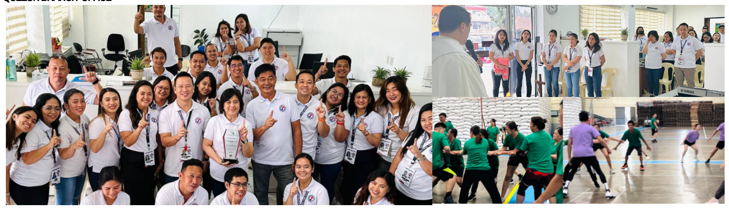
A simple but meaningful Thanksgiving Mass was held at NFA Quezon Branch Office and then, a short program was organized to honor the men and women of the branch office in appreciation of their outstanding efforts, remarkable accomplishments, dedication and services to the agency. There were fun games and sports to boost camaraderie among employees too.