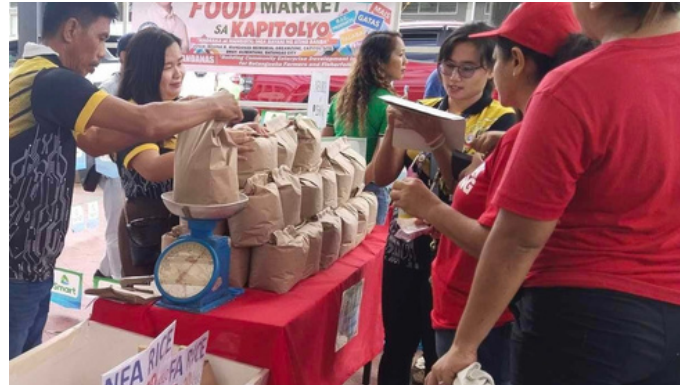
BATANGAS PROVINCIAL CAPITOL, BATANGAS CITY

NFA had sold local rice on the Provincial Capitol Compounds of the following provinces: Batangas, Laguna, Or. Mindoro, Quezon, Marinduque and Palawan. In Occidental Mindoro, the activity was held at three (3) different municipalities: San Jose, Mamburao and Sablayan. With the main objective of the agency to prioritize the readiness of stocks for emergencies and calamities, a total of 180 bags of NFA Rice (50kg/bag) only were sold in these areas in Southern Tagalog. -C.L. Gutierrez (correspondent)