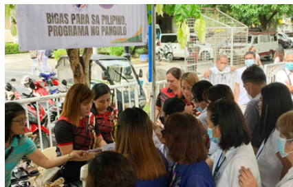
MUNICIPAL PLAZA, SABLAYAN, OCC. MINDORO