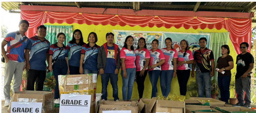
NFA Palawan employees with the teachers of Magbabadil Elementary School

“We make a living by what we get, but we make a life by what we give.” - Winston Churchill