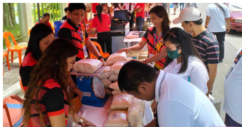
PROVINCIAL CAPITOL COMPOUND, SANTOL, BOAC, MARINDUQUE