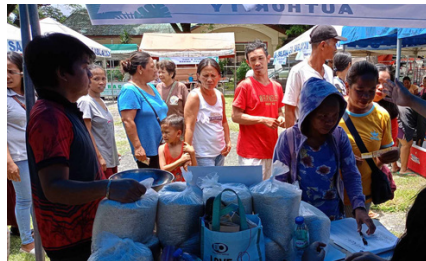
PROVINCIAL HALL, MAMBURAO OCC. MINDORO