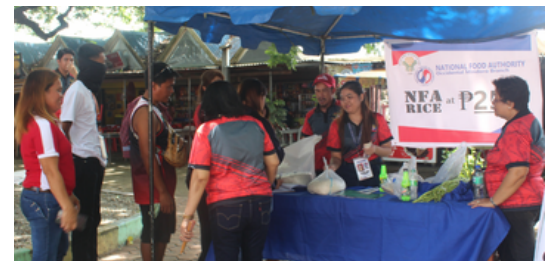
NATIONAL FOOD AUTHORITY