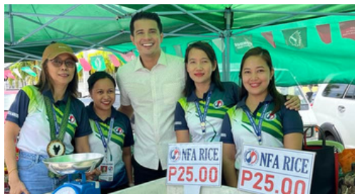
BELEN DRIVE CAPITOL COMPOUND, LUCENA CITY, QUEZON