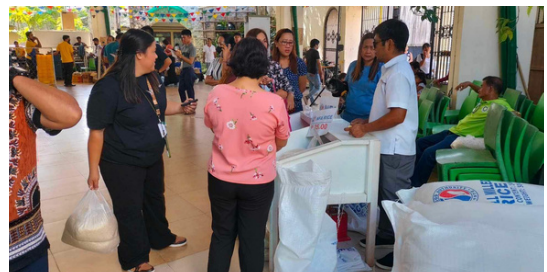
MUNICIPAL PLAZA, SAN JOSE OCC. MINDORO